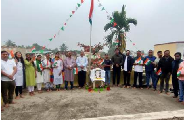
Mahashakti Foundation celebrated the 76th Republic Day of India at the State Coordination Office in Bhubaneswar.

This page captures the significant events, milestones, and initiatives undertaken during January 2025, showcasing the impactful work and achievements throughout the month.