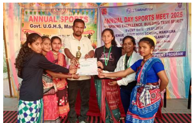
Mahashakti Foundation with the support of LTIMindtree Foundation organized the Annual Sports Meet at Manikera High School, M Rampur.