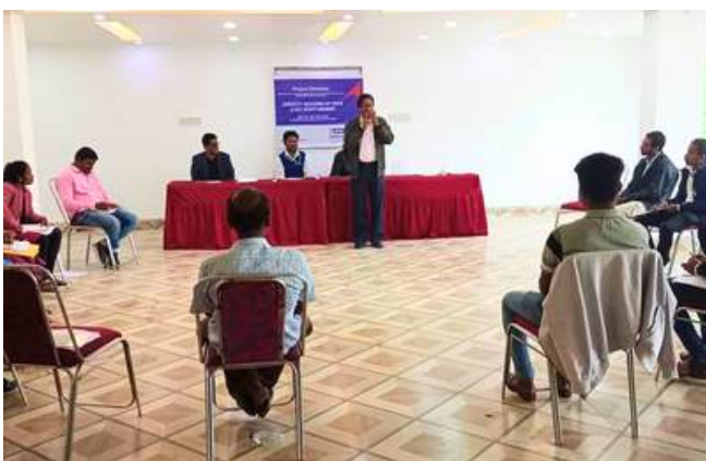
Three-day capacity-building program for Community Resource Persons and key staff members of Project Chirantan commenced at Bhuban, Dhenkanal.