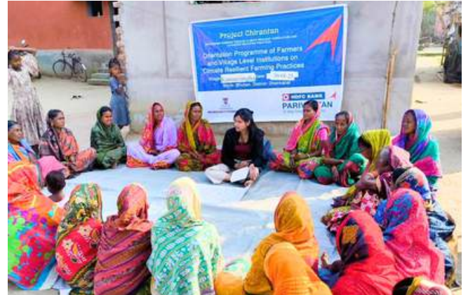
An orientation program on Climate Resilient Agriculture Practices was organized for farmers and village-level institutions at Bhuban, Dhenkanal.