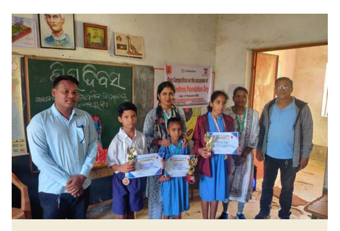
LTIMindtree Foundation Day was celebrated by Mahashakti Foundation, involving school-going children in Paikmal, Gudvella, and M. Rampur Blocks.