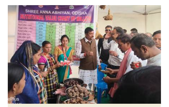
MSF's Bijepur Millet team organized a Millet Food and Exhibition Stall at Padampur that was graced by Sri Pradeep Purohit - Hon'ble MP, Bargarh.