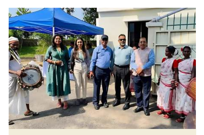
Mahashakti Foundation participated in the statelevel 'Urja Mela 2024,' organized by Tata Power Odisha Discoms in Bhubaneswar.