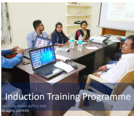
Induction Training Programme