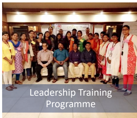
Leadership Training Programme