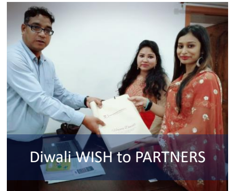
Diwali WISH to PARTNERS