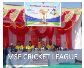
MSF CRICKET LEAGUE