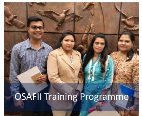
OSAFII Training Programme