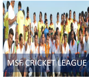
MSF CRICKET LEAGUE

The tournament ended on a super high note and became a huge success.