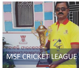
MSF CRICKET LEAGUE