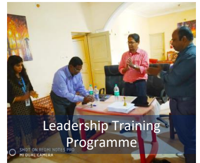
Leadership Training Programme