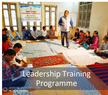
Leadership Training Programme