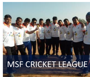
MSF CRICKET LEAGUE