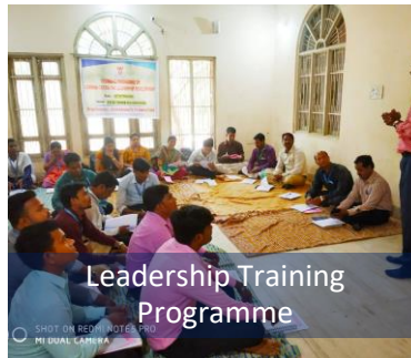
Leadership Training Programme