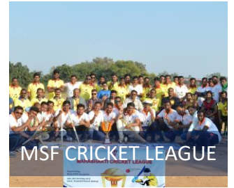
MSF CRICKET LEAGUE