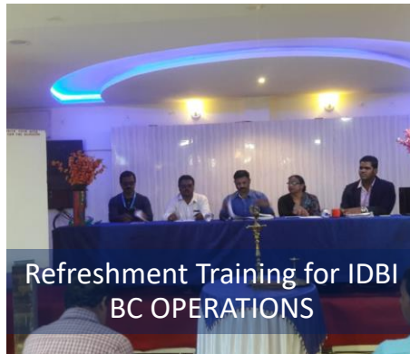
Refreshment Training for IDBI BC OPERATIONS