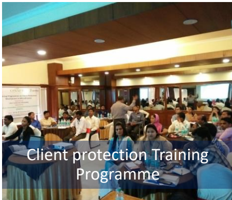
Client protection Training Programme