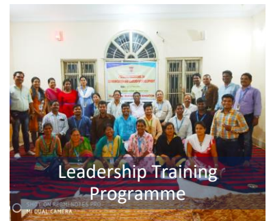
Leadership Training Programme