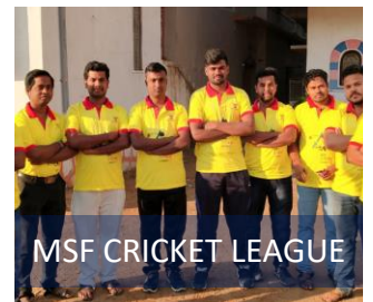
MSF CRICKET LEAGUE