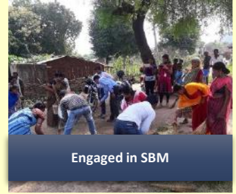
Engaged in SBM