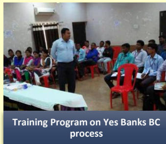
Training Program on Yes Banks BC process