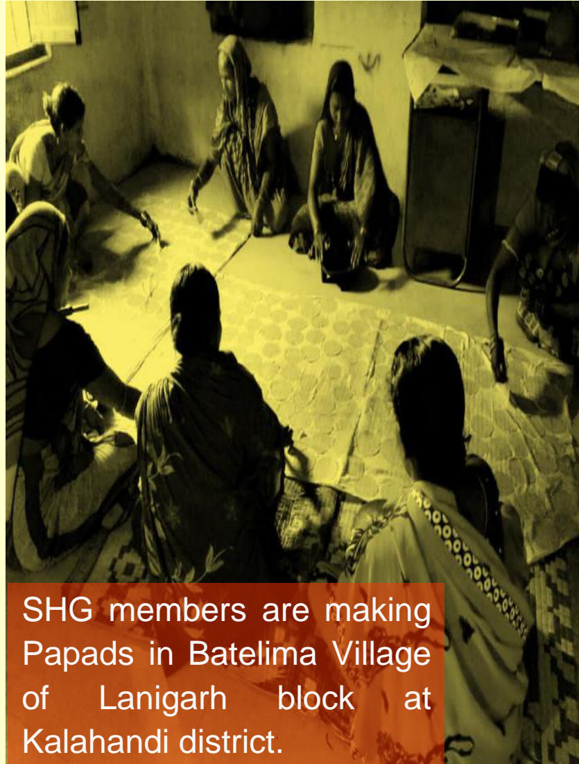
SHG members are making Papads in Batelima Village of Lanigarh block at Kalahandi district.