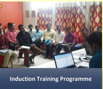
Induction Training Programme