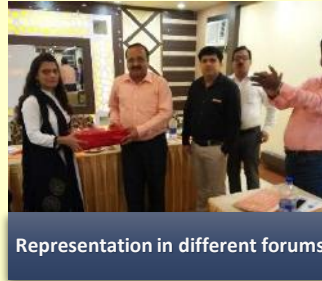
Representation in different forums