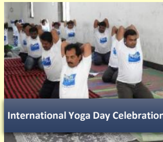
International Yoga Day Celebration

Employee as the primary and single most important asset of the organization contribute a lot to accomplish the goal and objective of the organization. Mahashakti Foundation attempted to raise engagement level of employees through various employee engagement activities to build a profound connection among employees and their organization. Celebrated International Yoga Day, Independence Day and Swachh Bharat Mission programme in 100 locations of Mahashakti Foundation over 13 districts. Also sensitised community about the benefits of Yoga and sanitation.