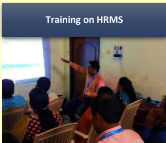
Training on HRMS