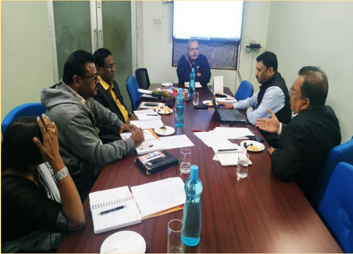
Governing Board meeting at SCO, Bhubaneswar