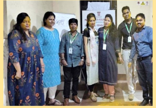
Holi Celebration at SCO, Bhubaneswar