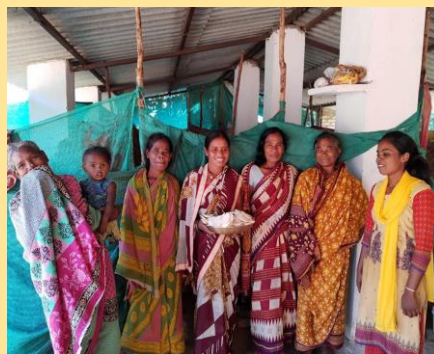
Mushroom Cultivation at Dunguri village