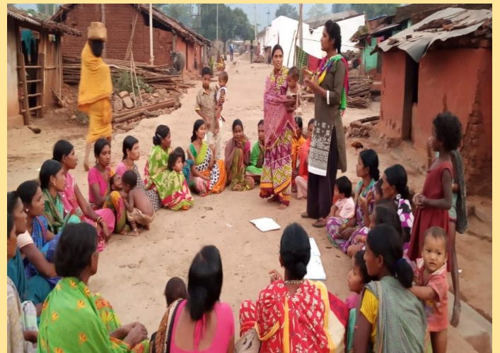
Group Meeting of SHG Women in Kalahandi District