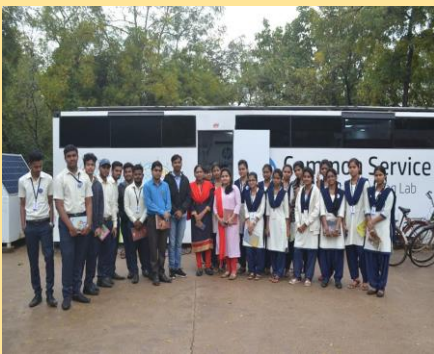
Technology Training Centre on Wheel