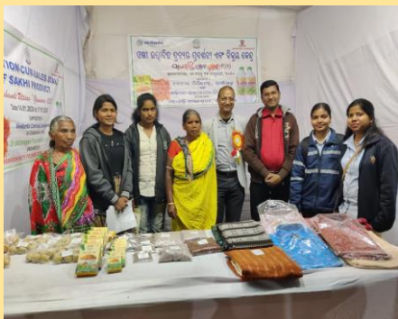
SAKHI Stall at Kalahandi Utsav 2019