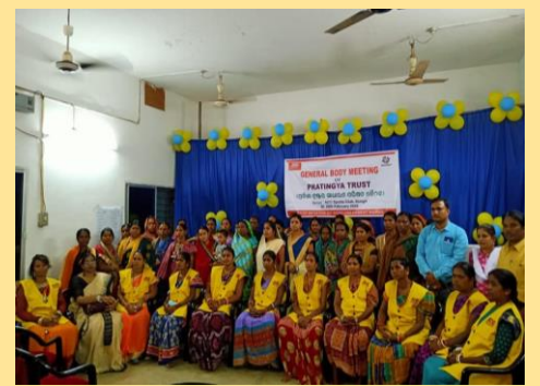
General Body Meeting of Pratingya Trust