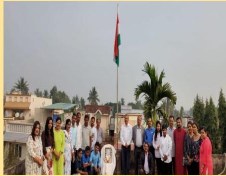
Republic Day Celebration at State Coordination Office