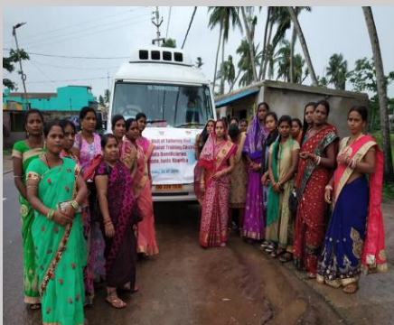
Exposure Visit by members of IOCL-SDI Project