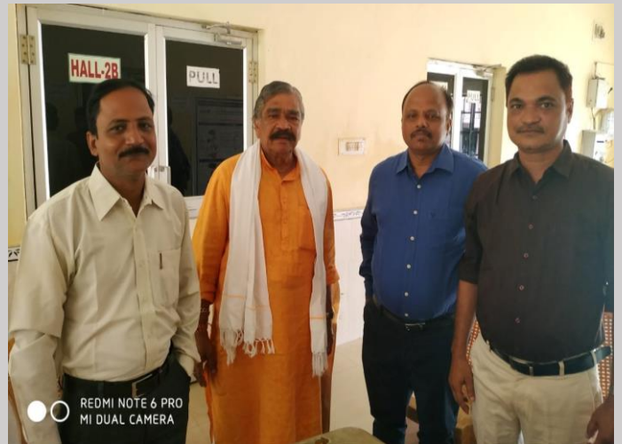
Honourable Jatani MLA|Sri Sura Routray visited MSF Relief Distribution Centre