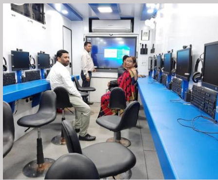
Technology Training Centre on Wheel