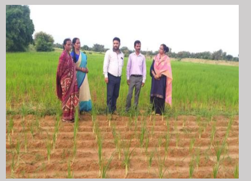
MSF Top Management Team visited Millet Cultivation Areas