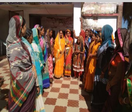
Recruitment of Bijuli Didi at Jagatsinghpur