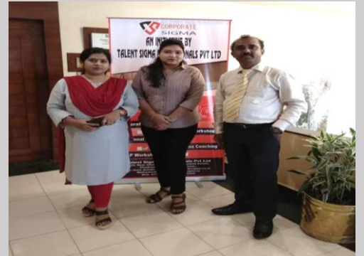
HR Team participated in Training of Trainers Programme