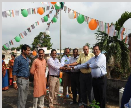
Independence Day Celebration at State Coordination Office