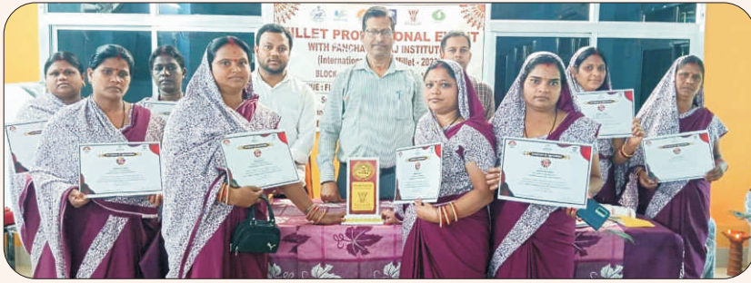
Cooking Competition among SHGs under the Crop Diversification Project at Ambabhona, Bargarh