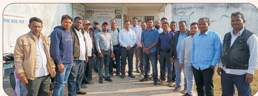
Capacity Building program for the FPO functionaries of Kandhamal and Kalahandi district with the presence of DDM NABARD.