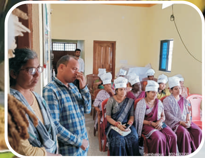
Millet Recipe Training to SHG Members at Redhakhol, Sambalpur.