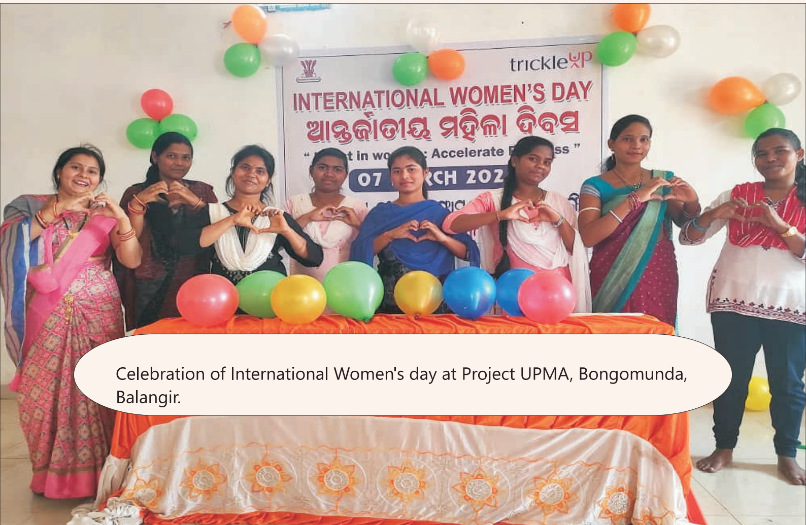
Celebration of International Women's day at Project UPMA, Bongomunda, Balangir.