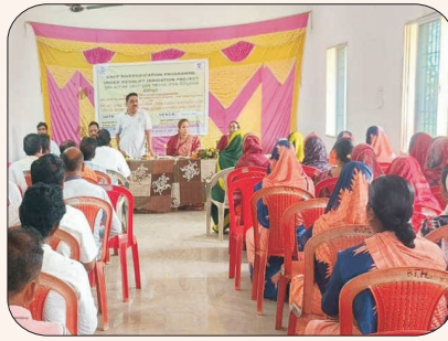
Farmers Training Program on Crop Planning, Advanced Package of Practices, Crop Diversification to multiply their income at Ambabhona, Bargarh, Odisha.