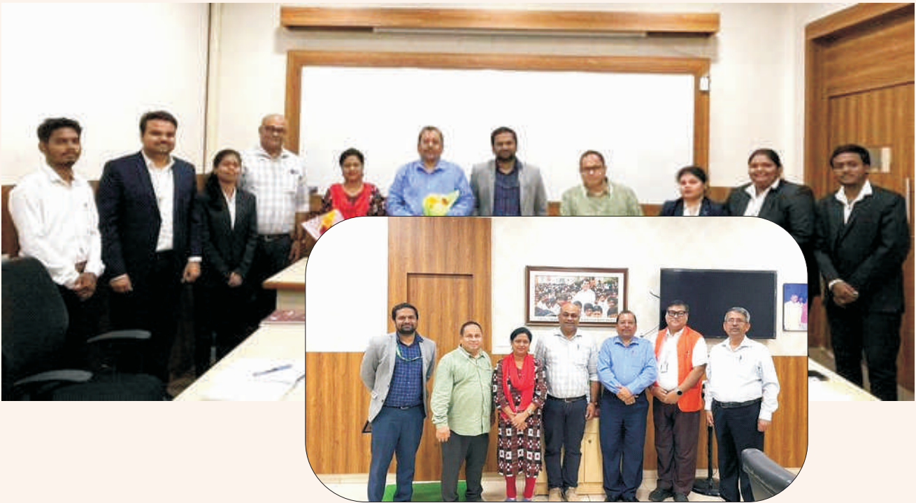
MSF's Recruitment Drive at KIIT School of Rural Management