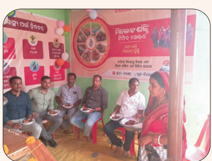
New Millets Tiffin Centre inaugurated at Balanda village of Bijepur block, Bargarh, Odisha.