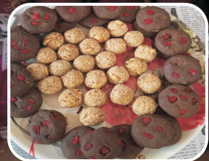
Cooking Competition among SHGs under the Crop Diversification Project at Ambabhona, Bargarh