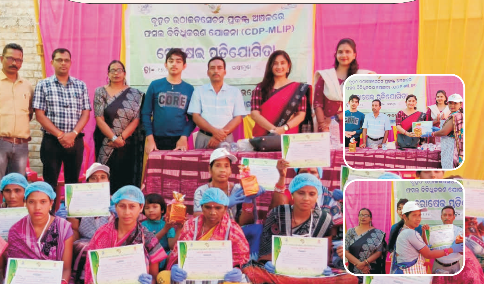
Cooking Competition at Laxmimunda, Block Tarabha dist Sonapur, under CDP MLIP Project.