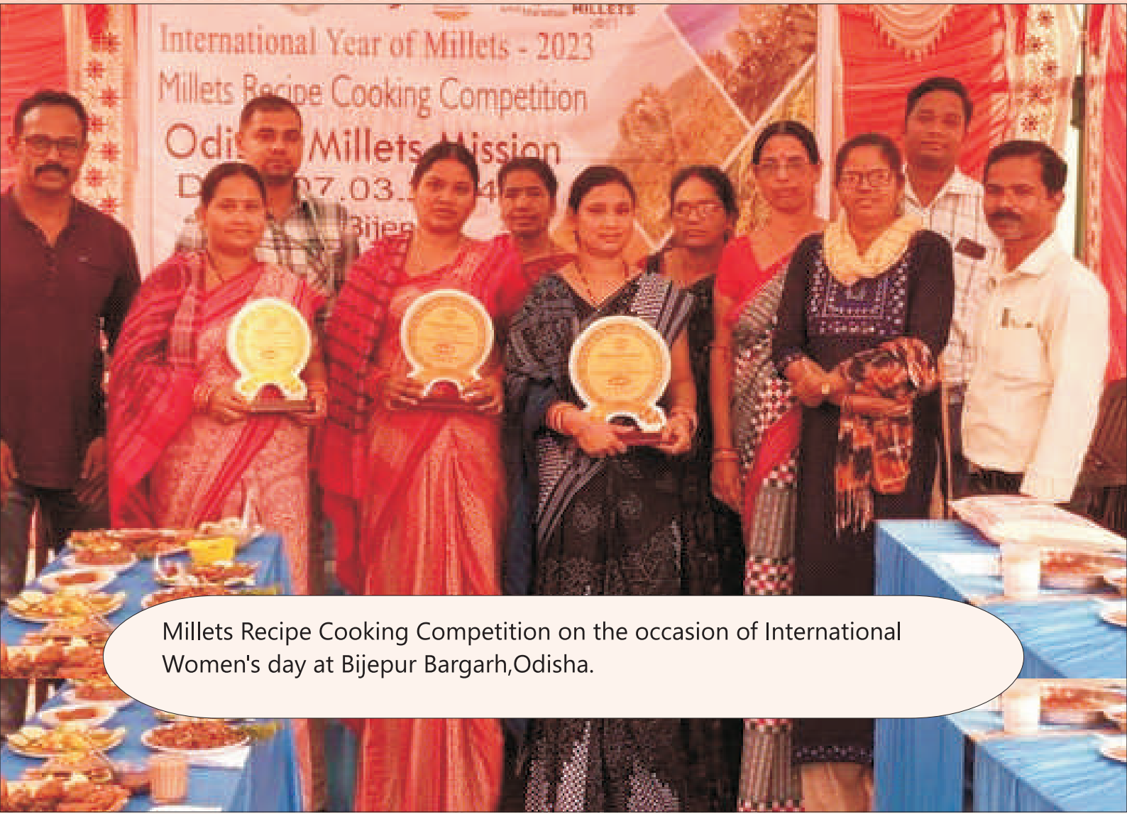
Millets Recipe Cooking Competition on the occasion of International Women's day at Bijepur Bargarh,Odisha.