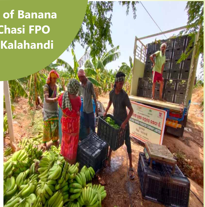
Marketing of Banana by Safal Chasi FPO Junagarh Kalahandi