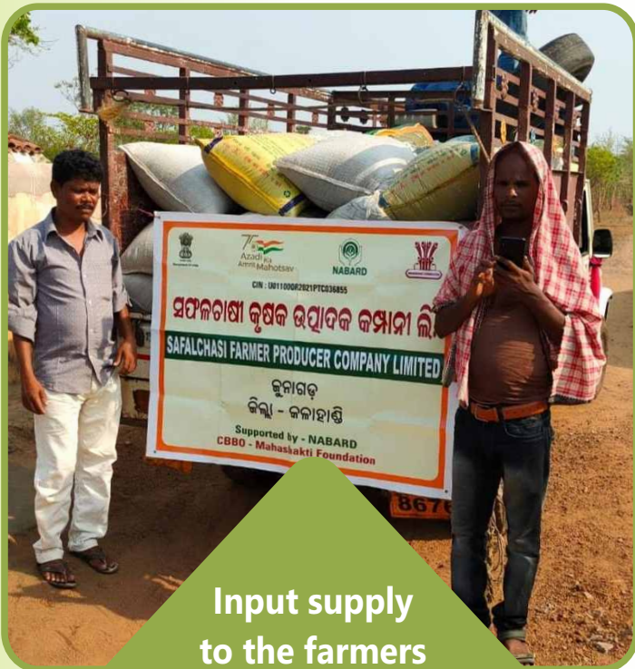
Input supply to the farmers of Safalchasi FPOs of Junagarh, Kalahandi district