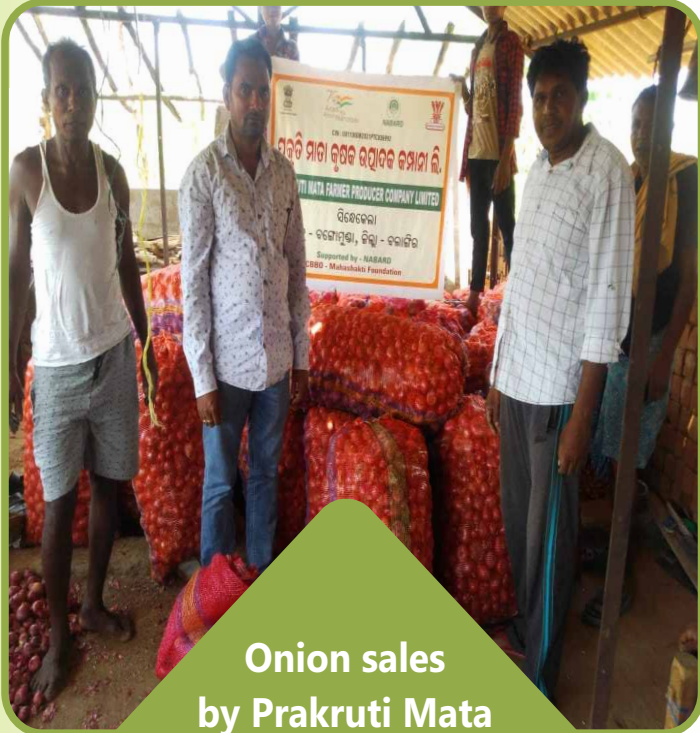
Onion sales by Prakruti Mata FPO of Sindhikela, Balangir district.