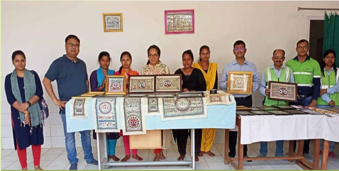
Visit of Group Head CSR Vedanta Limited to different micro enterprises promoted under Sakhi Project at Lanjigarh