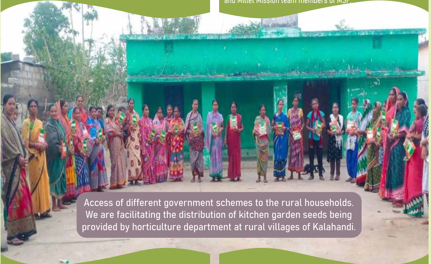
Access of different government schemes to the rural households. We are facilitating the distribution of kitchen garden seeds being provided by horticulture department at rural villages of Kalahandi.