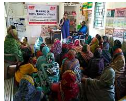
Digital Financial Literacy Training to SHG Members