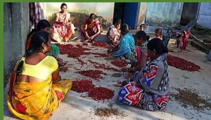
Chilli Powder Unit by Maa Tarini SHG