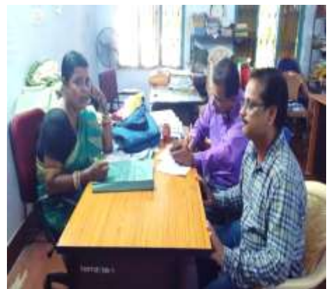
Meeting with Mission Shakti officials