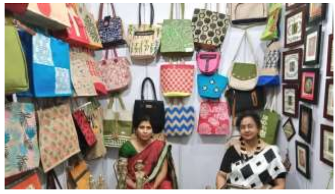
Jute Bag Exhibition at 3 rd ASOMACON-2019 in AIIMS Bhubaneswar