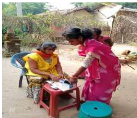
Kiosk Banking Facility to SHG Members