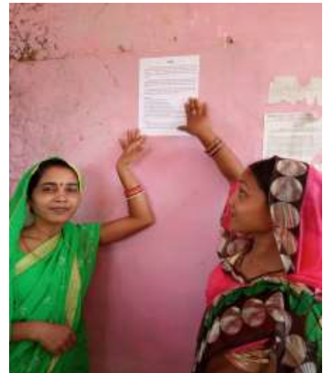
Notice on GPLF Wall for Written Test for the selection of Bijuli Didis

“Operating Policy” for the GPLF to coordinate the metering, billing and collection process for CESU by Bijuli Didi was prepared and implemented. Training program and modules with delivery – presentation, handbooks, trainers etc. were arranged which in turn enabled the Bijuli Didis to collect present and overdue bills from around 28,000 consumers which reduces degree of techno-commercial losses to a good extend. After seeing the success of the models, CESU is planning to replicate the model in other Divisions. By doing bill collection activities, the Bijuli Didis who have never thought of to engage themselves in any regular job are able to earn Rs.1500/- to Rs.8,000/- per month. From the income and incentive, GPLF keeps 10% for need based community development programs. Coming year Mahashakti Foundation has a plan to cater at least 70,000 consumers in the district.