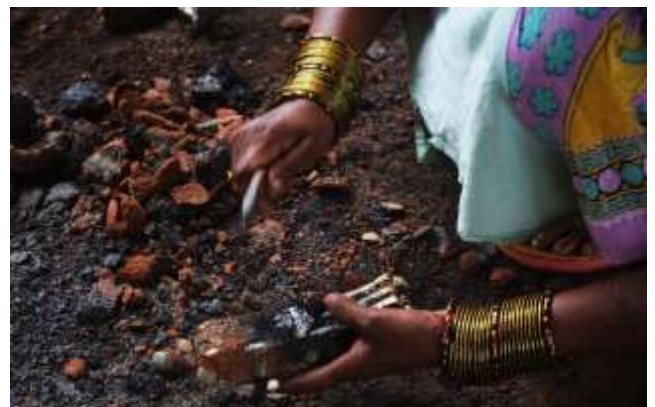
Making of dhokra products

This has helped the artisans of Jhigidi & Gatiguda villages significantly to make their products and sell the same in market. A Producer Company named "Kala Punaruthan Producer Co. Ltd." is formed for the sustainable livelihood development of the artisans and all the