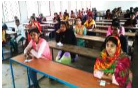
Bijuli Didi Written Test