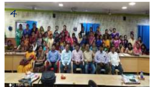
Bijuli Didi Training Program