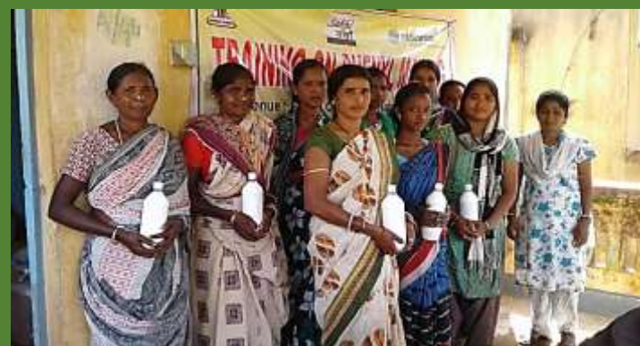
Phenyl Unit by Buddhimaa SHG