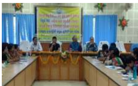
Bijuli Didi Training Program

Presently, the micro franchisee agreements with GPLFs are being finalized and signed. This activity is being undertaken under the aegis of Odisha Livelihoods Mission (OLM) through the respective Block Level Coordinators (BLCs) in Erasama, Kujanga and Tirtol blocks. Mahashakti Foundation through SPI intends to design and deliver continuous support for building capacity of the WSHGs through a WSHGs Empowerment Program. The program intends to assist the BLCs in design and implementation of a mechanism for selecting the members who will be working on behalf of the micro franchisees, develop the working plan for the members and training of the SHG members to deliver services efficiently.