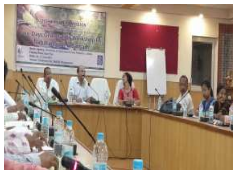
Workshop on promotion of Millets