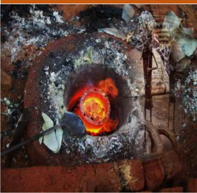
Moulding Process of Dhokra Products