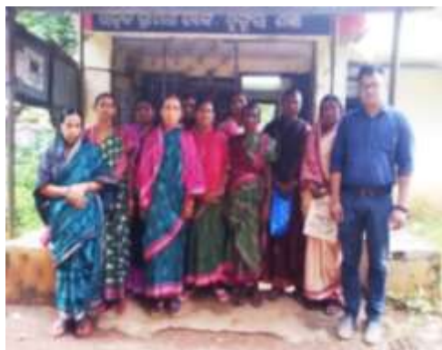
Bank Linkage of SHG Members