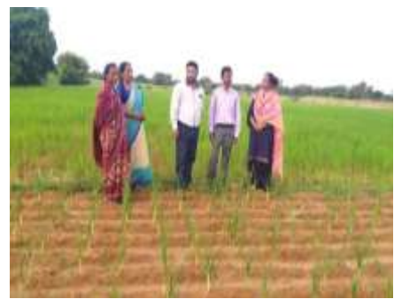
MSF top Mngt Visit