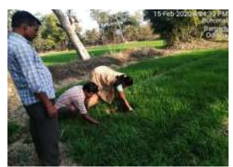
Ragi Planting for Rabi Season