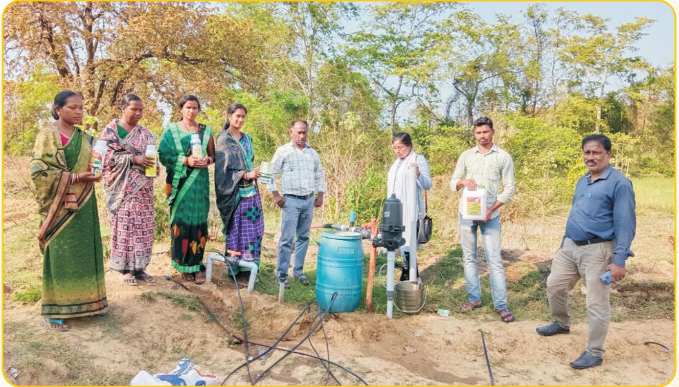
HDFC Bank Parivartan - Demonstration of bio fertilisers. Hand holding support to the farmers in the agriculture field by our agricultural experts.