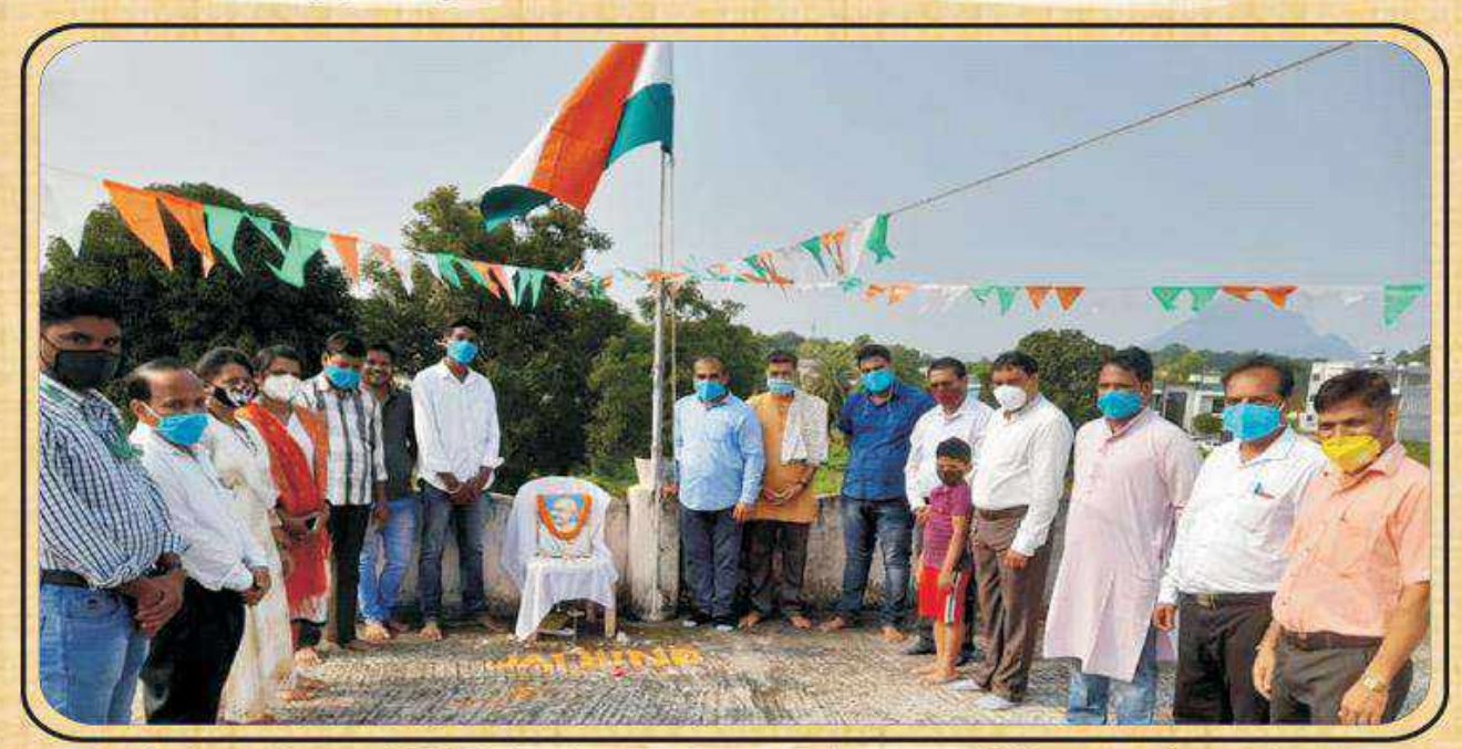
Celebration of 75th Independence Day at different locations.