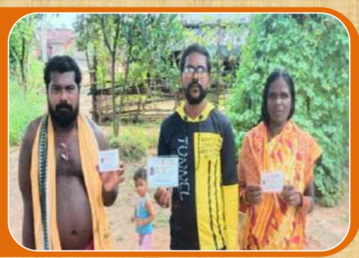
As on September 30, 2021 Mahashakti team has already completed required surveys and below table represents migrant workers enrolment detail: