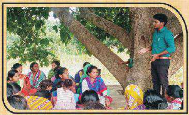
Community Mobilisation on Ultra Poor Market Access Program in Bolangir District, Odisha.