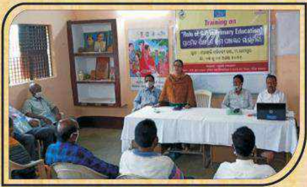
Training program on Role of Gram Panchayats on Primary Education Supported by State Institute of Rural Development and Panchayat Raj, Govt of Odisha