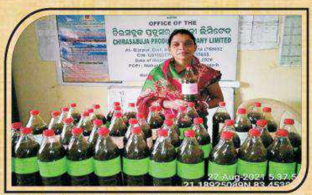
Production and sale of Handikhata(Organic Manure) by Chirasabuja Producer Company Limited (FPO) at Bijepur, Bargarh, Odisha.