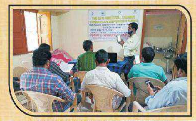
Mobile Application Training Program for farmers. Understanding the market and getting information on agriculture.