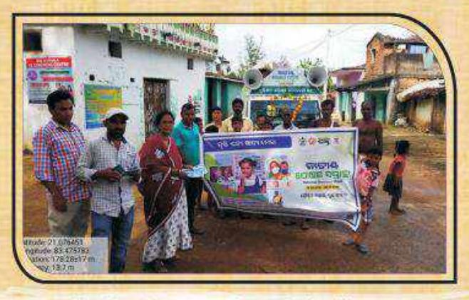
Nutrition Awareness Campaign in different villages of Bijepur block of Bargarh district, Odisha.