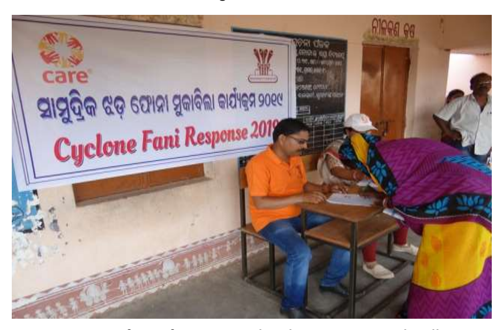
Registration of Beneficiaries in a distribution point at Khurdha Dist .