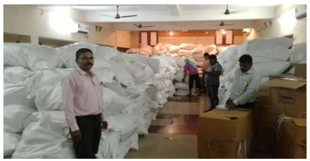
Storage of Kits at Community Hall Dharma Vihar, Khandagiri Bhubaneswar