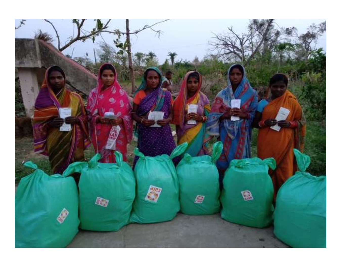
FANI affected beneficiaries in Balianta Block of Khurdha Dist with CARE Relief Kits