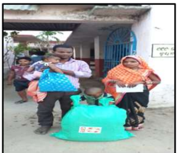
(Picture 8, 9, 10 and 11: Relief kits being distributed by CARE India in association with MSF)