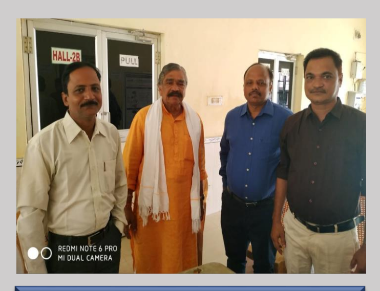
Honourable Jatani MLA|Sri Sura Routray visited MSF Relief Distribution Centre