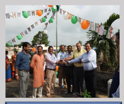
Independence Day Celebration at State Coordination Office