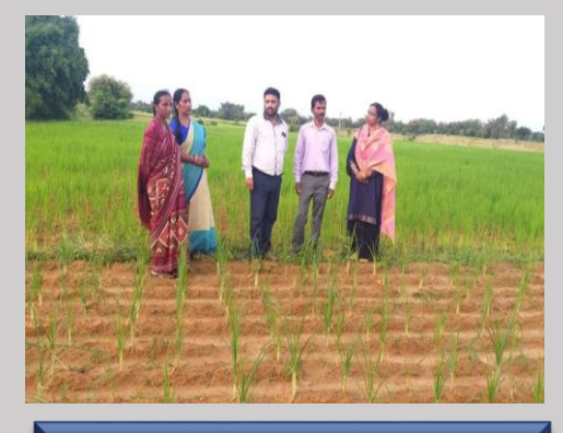
MSF Top Management Team visited Millet Cultivation Areas