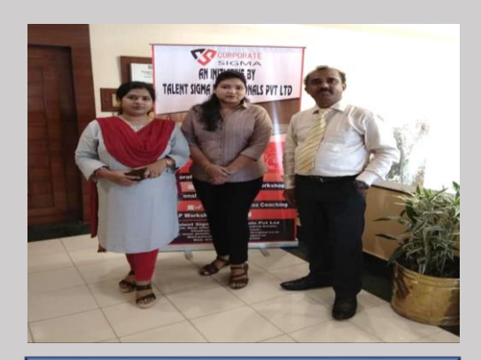
HR Team participated in Training of Trainers Programme