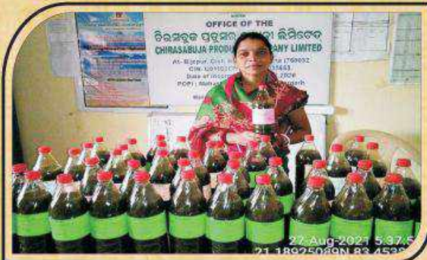
Production and sale of Handikhata(Organic Manure) by Chirasabuja Producer Company Limited (FPO) at Bijepur, Bargarh, Odisha.