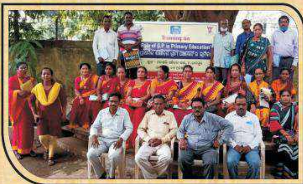
Training program on Role of Gram Panchayats on Primary Education Supported by State Institute of Rural Development and Panchayat Raj, Govt of Odisha