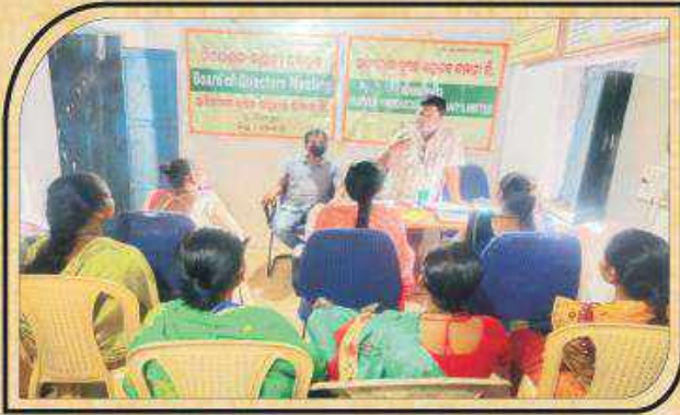
Meeting of Board of Directors of AdimaChasi FPO, Thuamulrampur, Kalahandi, Odisha