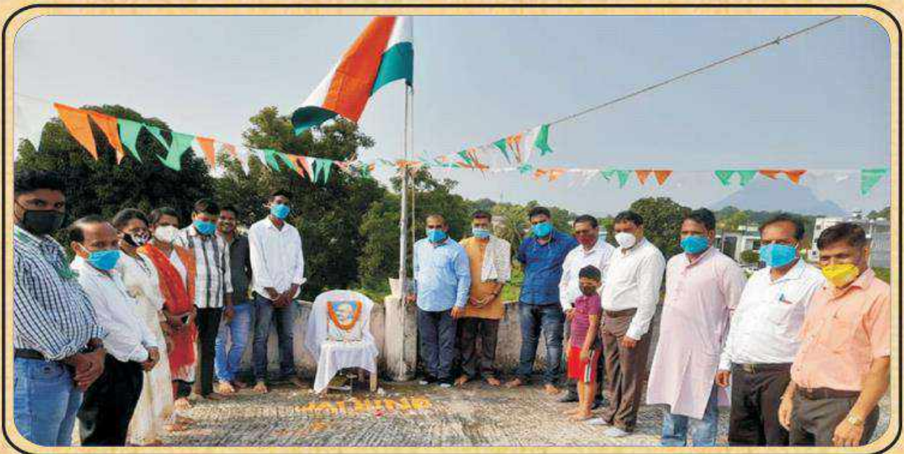
Celebration of 75th Independence Day at different locations.