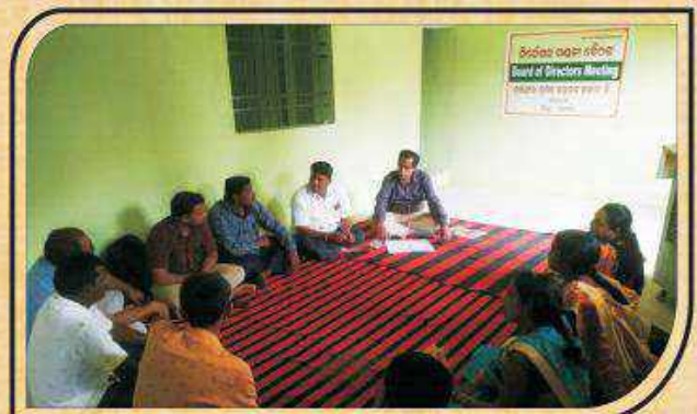
Meeting of Board of Directors of Krushnahira Farmers Producer Company, Jharbandh , Bargarh.