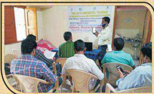
Mobile Application Training Program for farmers. Understanding the market and getting information on agriculture.