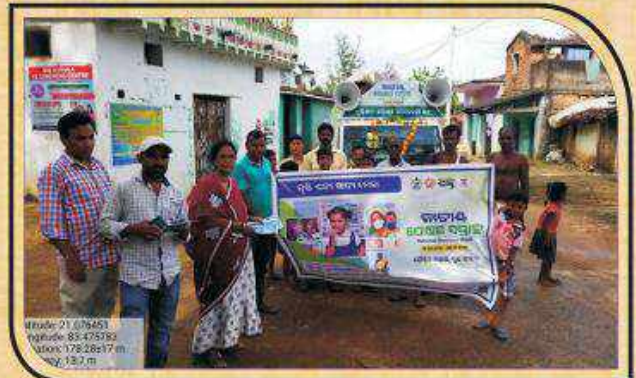
Nutrition Awareness Campaign in different villages of Bijepur block of Bargarh district, Odisha.